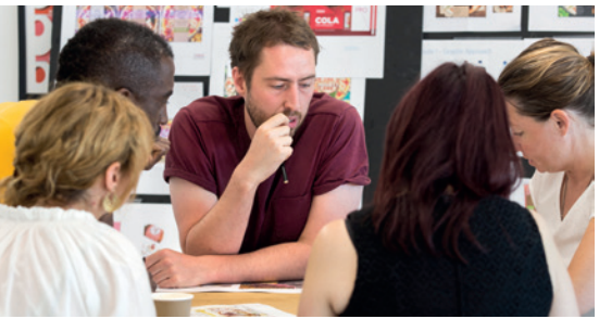
Ogilvy & Mather, a Living Wage employer

Living Wage South Bank incorporated multiple engagement opportunities, with feedback and contributions from a range of business sectors informing the research and the report. This encompassed: gauging awareness of the Living Wage accreditation process and potential barriers; project promotion; 121 meetings; and business seminars. Overall, more than 250 business were engaged in the project.