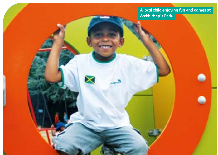
A local child enjoying fun and games at Archbishop's Park.

Waterloo Time Bank 1 Secker Street, SE1 8UF WaterlooTBBroker@aol.com